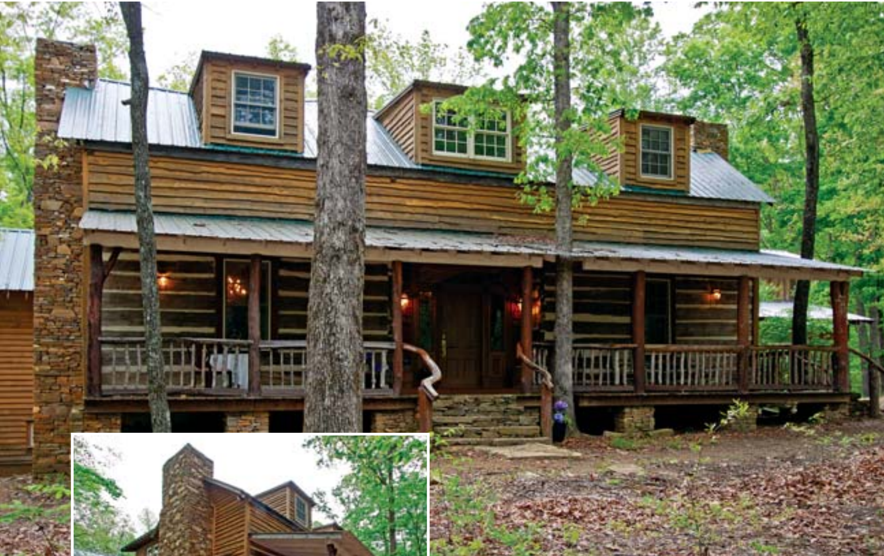
ABOVE AND LEFT: The exterior was designed so the old dogtrot would harmonize with the larger addition.